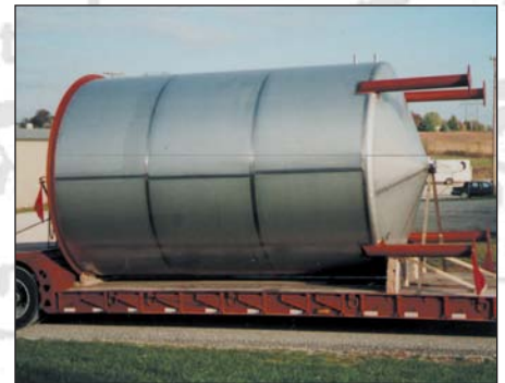
9500 Gallon Single Wall Tank with internal helical steam coil.

We fabricate premium quality vessels, tanks, hoppers, bins, columns, and structures of stainless steel, nickel alloy and aluminum. We build from the very smallest up to 12' diameter x 40' overall length. Finishes from non-polished to 320 grit pharmaceutical quality with any type of features.