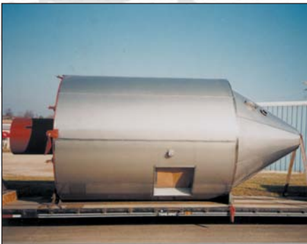
T-310 S.S. Spray Dryer w/air heater for APV Anhydro - Dryer Group

At Watson Metal Masters we take pride in being located in the heart of tank country. Our location allows us to draw from a highly qualified labor force and other support systems geared around our industry. It all started back in 1956 with a few tanks being built. Now Springfield accounts for well in excess of $100 million worth of custom fabricated tanks and vessels annually.