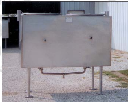
2 x 100 Gallon Multi Compartment Tank with heat transfer surface and agitators.